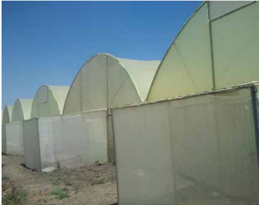
The entrance cubicle provides a changing area and a footbath for greenhouse workers.

Plant growth is determined by the controlled conditions inside a greenhouse. Greenhouse production requires constant temperatures and humidity control - around the clock. In large-scale professional greenhouse production, this is done with the help of technical equipment which small farmers cannot afford. But farmers need to check temperature and humidity in small greenhouses. A greenhouse can overheat very easily in the bright sun, and condensation must be checked. Therefore, ventilation is