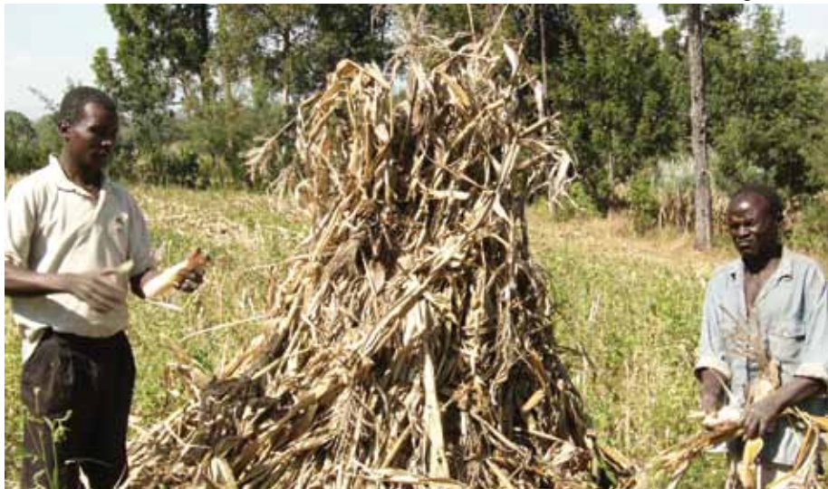
Early harvesting and proper drying ensures maize does not develop moulds (as shown in the picture below).

Dry your maize immediately after harvest while the maize is still on the