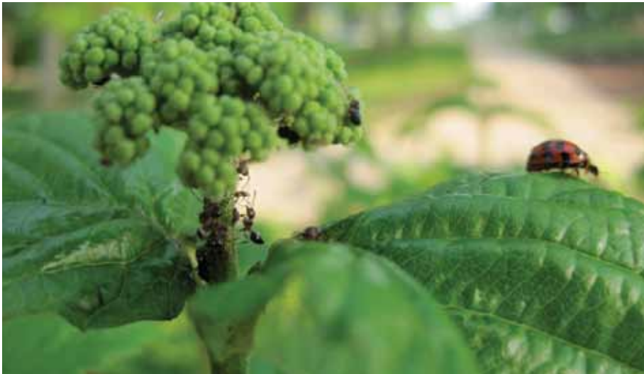
Ants feeding on sap produced by aphids and a lady bird (right) eating aphids.