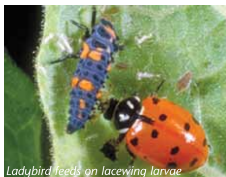
Ladybird feeds on lacewing larvae

In conventional fields that have not been sprayed with insecticides, the pest control through natural enemies seems to work better – thanks to the higher biodiversity in these fields. The biodiversity is far greater in fields under organic management. The researchers found five times as many plant species and 20 times more types of pollinating insects in the 15 organic crop fields included in the study than they did in conventional fields. Furthermore, they detected three times as many natural enemies of aphids and five times fewer aphids in the organic fields than in the conventional fields.