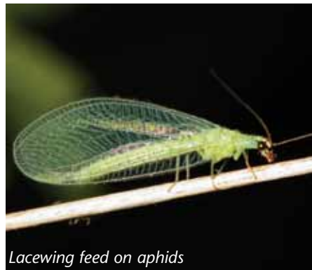
Lacewing feed on aphids

The scientists offer two possible explanations for this phenomenon. One possibility is: The insecticides indiscriminately kill off beneficial animals that feed on the aphids, such as ladybugs or the larvae of lacewings and hoverflies. Because their enemies are missing, the aphids find it easier to return and proliferate than in insecticide-free fields. Another possibility is an indirect effect: The insecticide just kills the aphids,