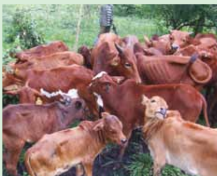
Good management practices help maintain your animals health

during close contact with the animal. This disease is life threatening and more frequent in Kenya than in most other countries of the world. Therefore always boil raw milk before you consume it! Preparing traditional fermented milk does not eliminate the tuberculosis bacteria.