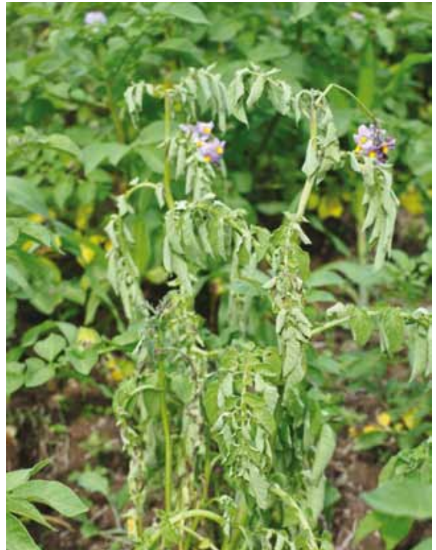
This sign of bacterial wilt is often mistaken for lack of water