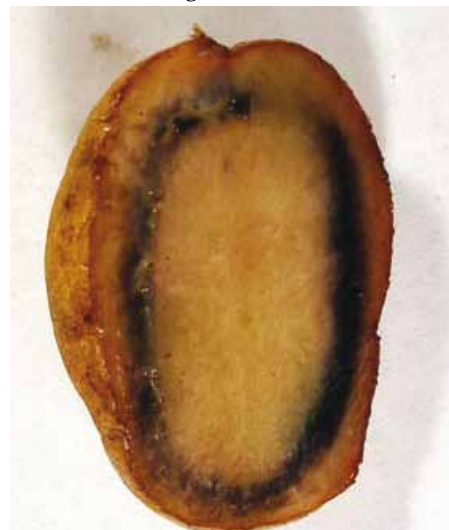
The black ring shows the presence of Ralstonia solanacearum , the bacteria that causes the wilting of potatoes