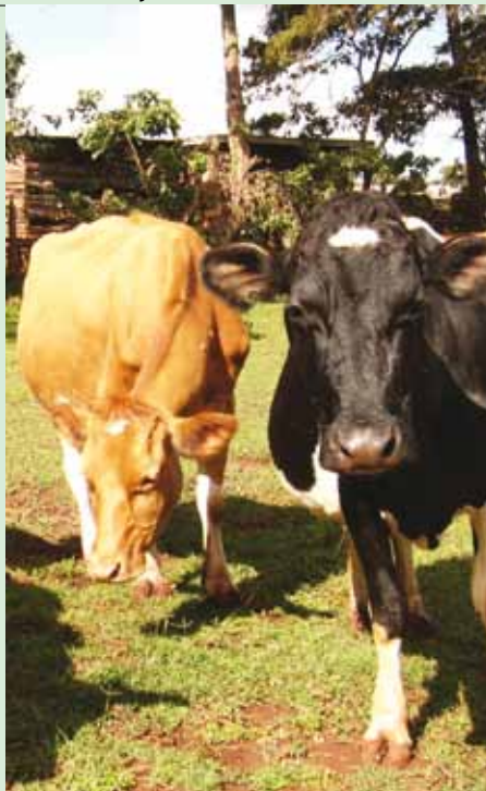
There is growing interest in dairy cows. We are receiving many questions in this area.

Therefore, we recommend that farmers keep livestock out of avocado orchards, and to avoid planting avocado trees near animal enclosures.