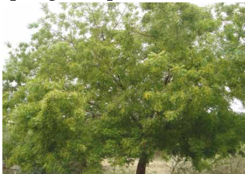
A fully grown neem tree can produce upto 50 kg of seeds in a year.

- Achook: Made in India, available in Agrovet shops.