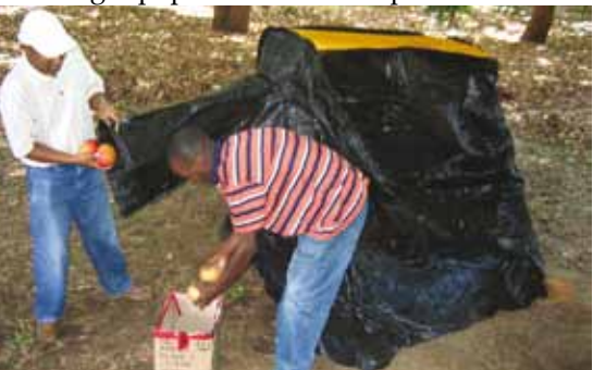
An augmentorium attracts fruit fly predators

Poorly managed or abandoned orchards and a variety of wild hosts can result in high population build up of fruit flies.