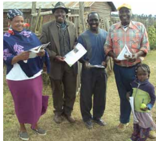
Well-informed farmers improve their livelihoods. Our picture shows a group of farmers after a TOF training

It all comes back to the formation of an association. An individual cannot be able to convince the government to take notice of problems on any sector. This is especially for small-farmers who in the eyes of many have no say. However, once we are organised and represented as a serious organisation we will have some power. We will be able to influence those that hold office in our interest to perform their duties. We will be able to eradicate the