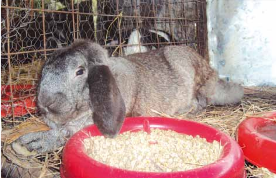
Rabbit keepers need knowledge on feeding, housing, breeding and also a market