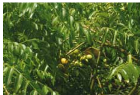
Neem tree with ripe fruits

In the last few weeks we got a good number of questions from farmers on this wonderful tree, we tell you how to make your own extracts from neem and how to use them. Page 3