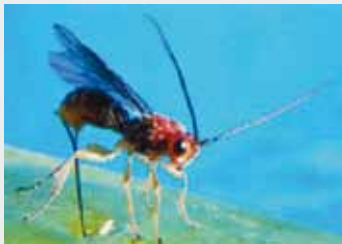
The wasp Fopius arisanus

One of the methods of controlling fruit flies is the use of beneficial insects or parasites also called parasitoids. One of an efficient biological control agent is the wasp Fopius arisanus which is very effective at controlling the fruit fly Bactrocera invadens . It attacks the eggs of the fruit fly and develops through the larval stages of the fruit