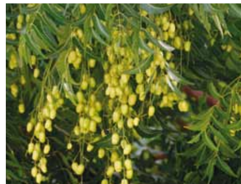
Most farmers take the tree Melia Azedarach (left) which grows in most highland areas in Kenya for the neem tree (right). The two trees are different—so be careful when buying seedlings.