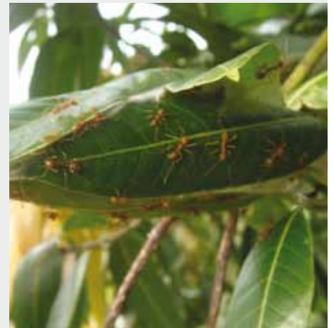
Weaver ants on a mango tree

between mango trees in an orchard to facilitate the movement of the ants from one tree to the next. Existing weaver ant colonies can also be harvested and introduced to other trees in the orchard where they are not present. The weaver ants technology are being promoted in many countries of West Africa, in Tanzania and in Asian countries. (Sunday Ekesi)